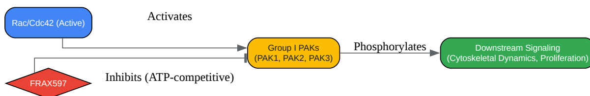
Diagram 1: Simplified FRAX597 Mechanism of Action

Click to download full resolution via product page