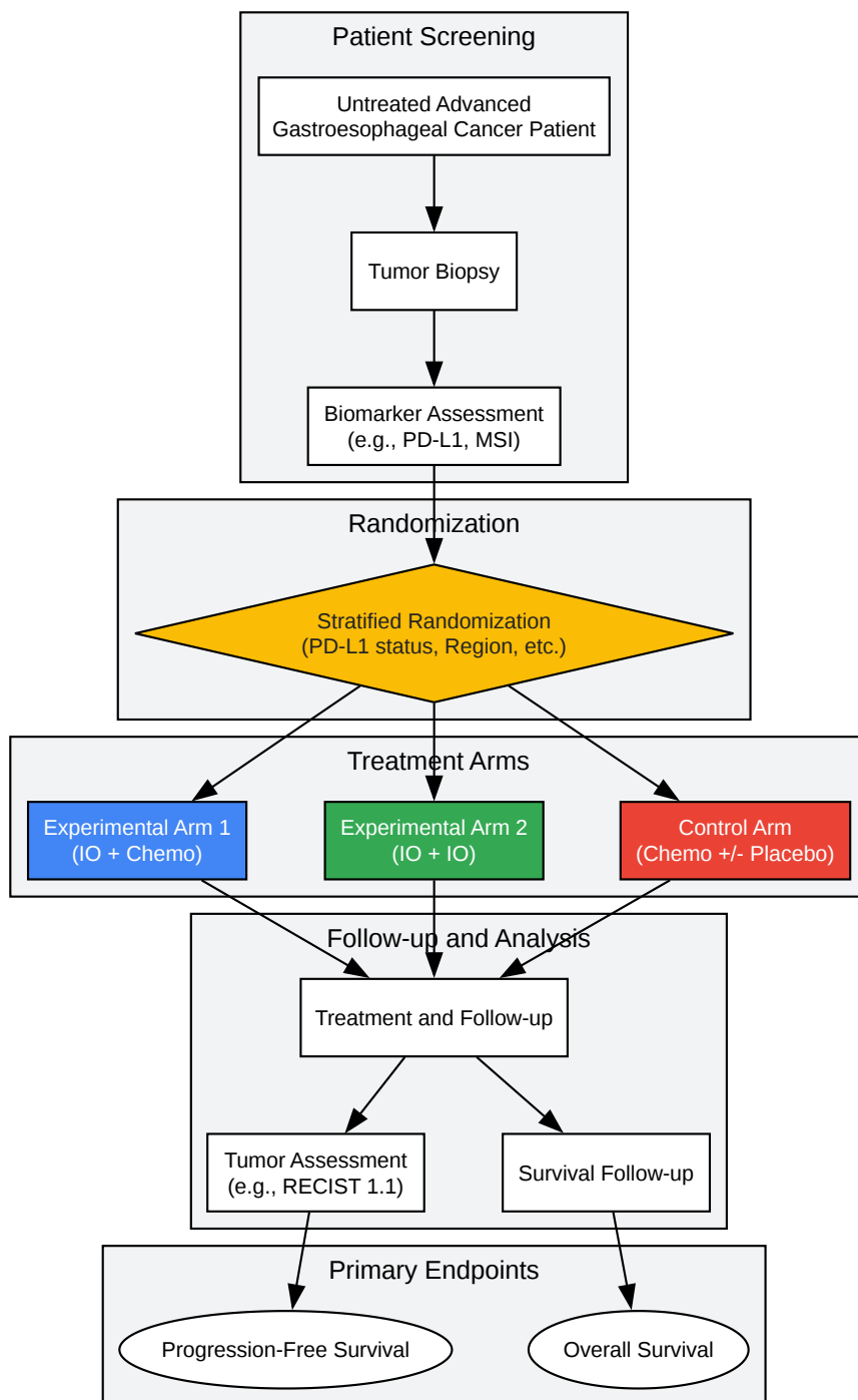
Logical Flow of a Modern Immuno-Oncology Trial

Click to download full resolution via product page