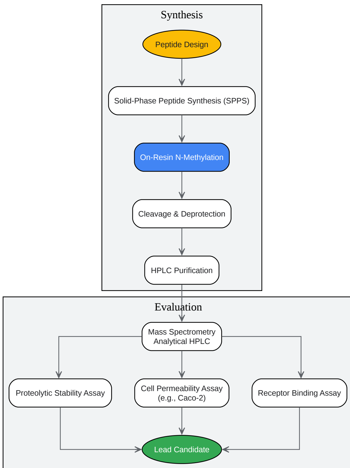
Figure 1: Core effects of N-methylation on peptide properties.

Click to download full resolution via product page