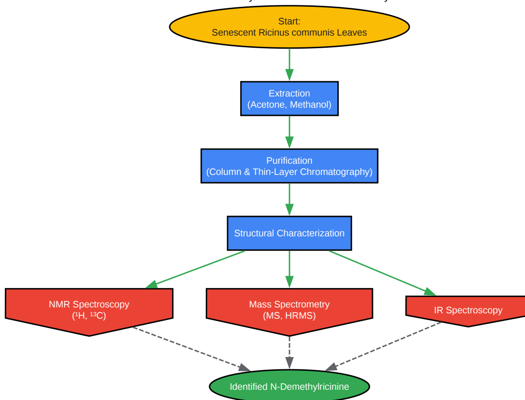
Workflow for N-Demethylricinine Isolation and Analysis

Click to download full resolution via product page