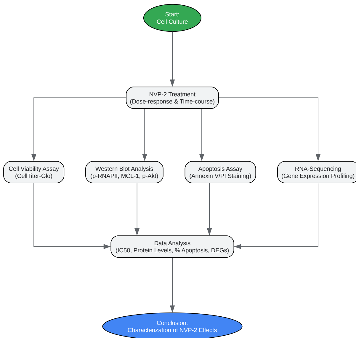
Experimental Workflow for NVP-2 Characterization

Click to download full resolution via product page