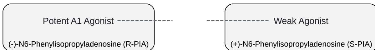
Fig. 1: Enantiomers of N6-Phenylisopropyladenosine

greater than that of the S-PIA isomer.[2][3] This dramatic difference in binding affinity forms the basis of PIA's utility in distinguishing adenosine receptor subtypes.[4]