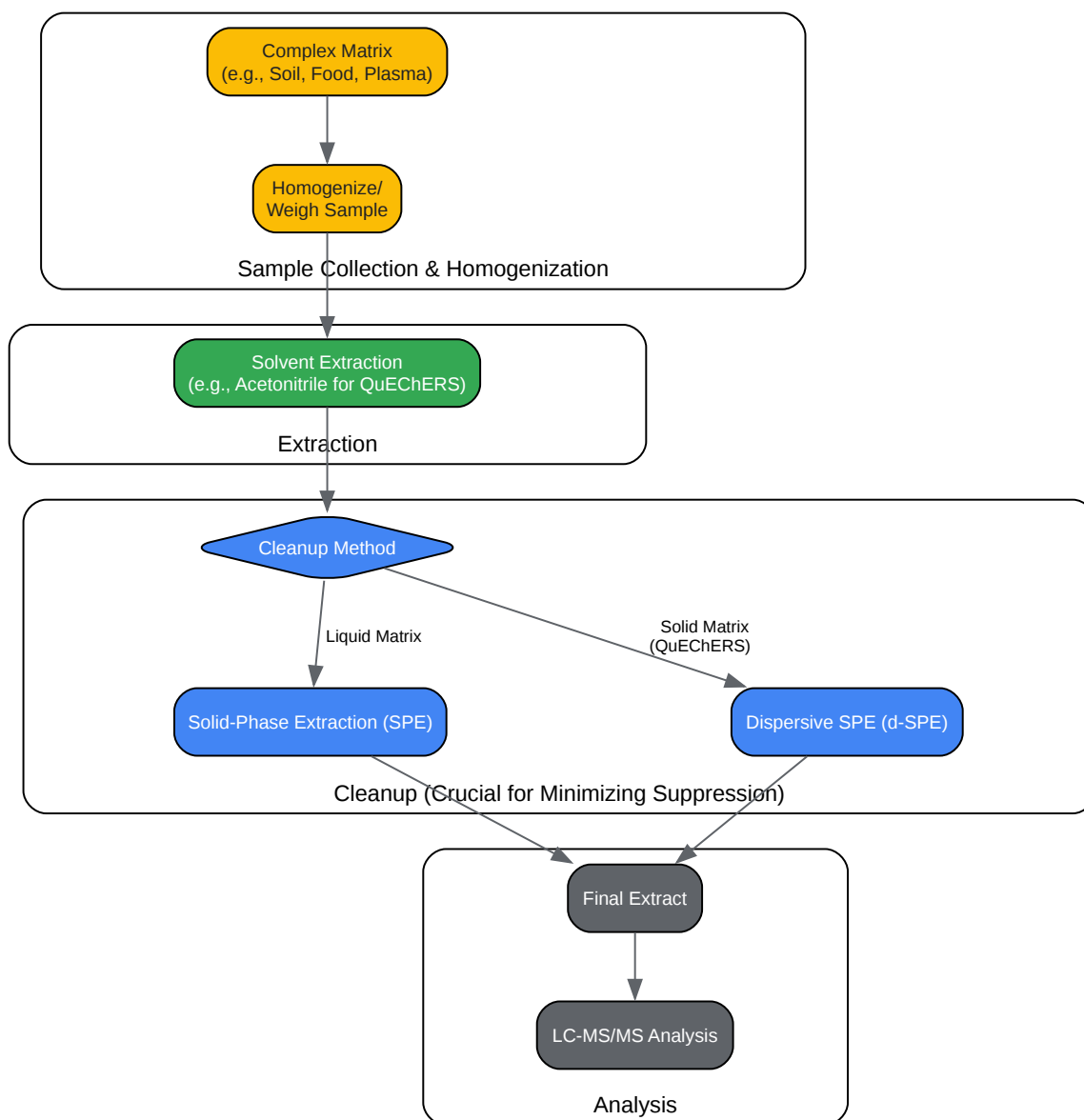
Figure 2: General Sample Preparation Workflow

Click to download full resolution via product page