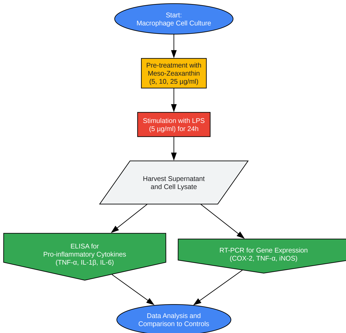
Figure 3: Experimental Workflow for In Vitro Anti-inflammatory Assay

Click to download full resolution via product page