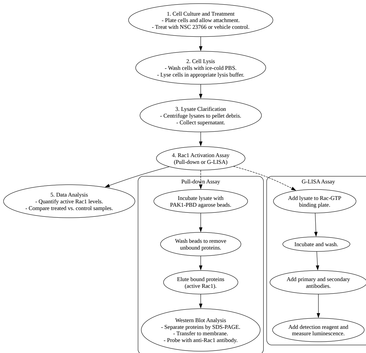
Caption: Rac1 Signaling Pathway Inhibition by NSC 23766 .

Click to download full resolution via product page