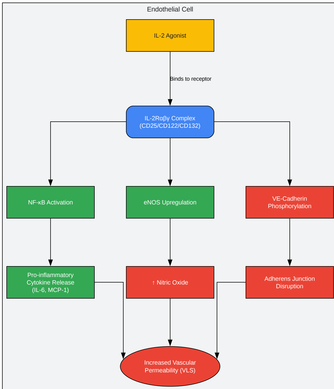
IL-2 Signaling in Endothelial Cells Leading to VLS

Click to download full resolution via product page