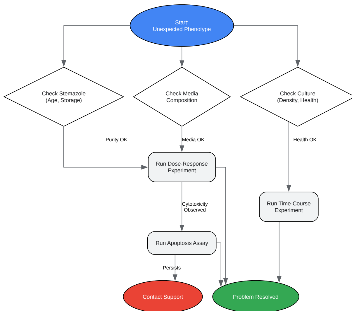
Diagram 3: Troubleshooting Logic Flow

Click to download full resolution via product page