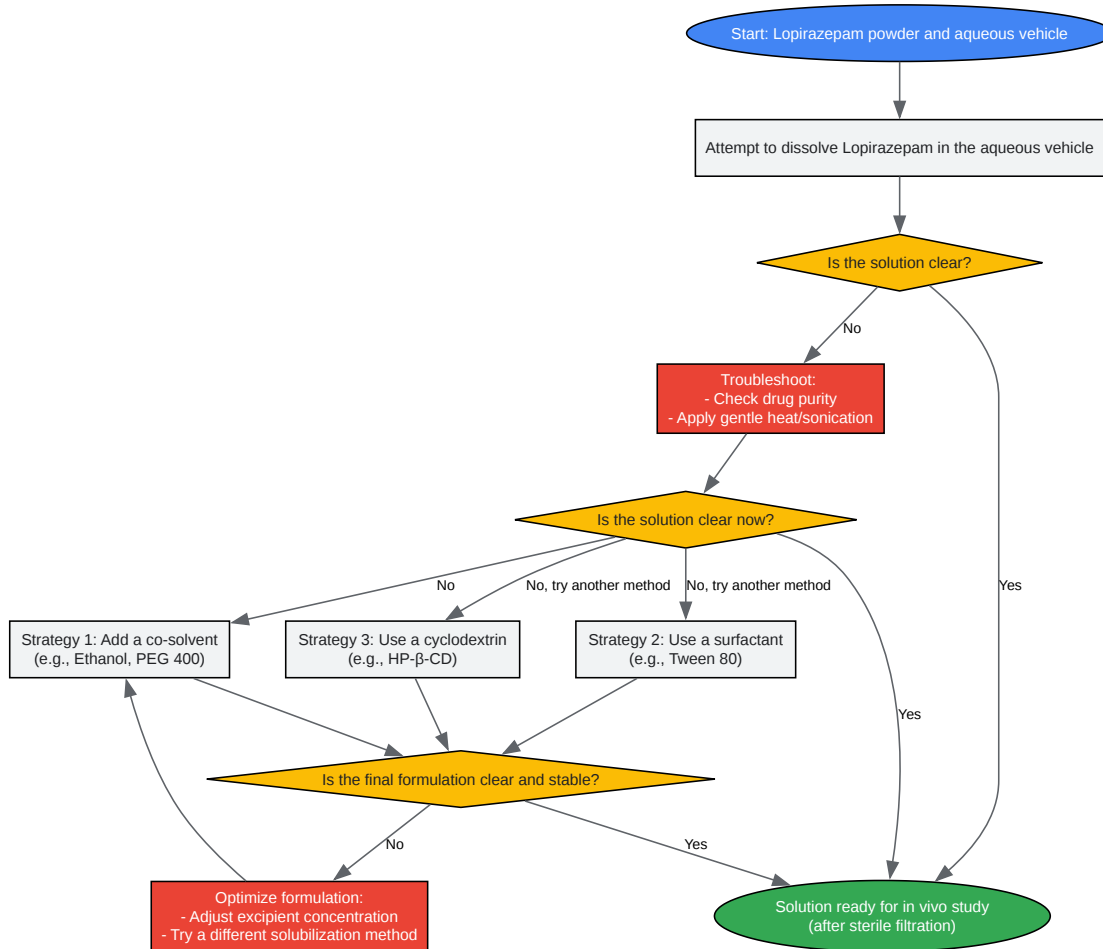
Troubleshooting Workflow for Lopirazepam Solubilization

Click to download full resolution via product page