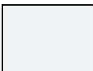
Chemical Structure of Lennoxamine

Click to download full resolution via product page