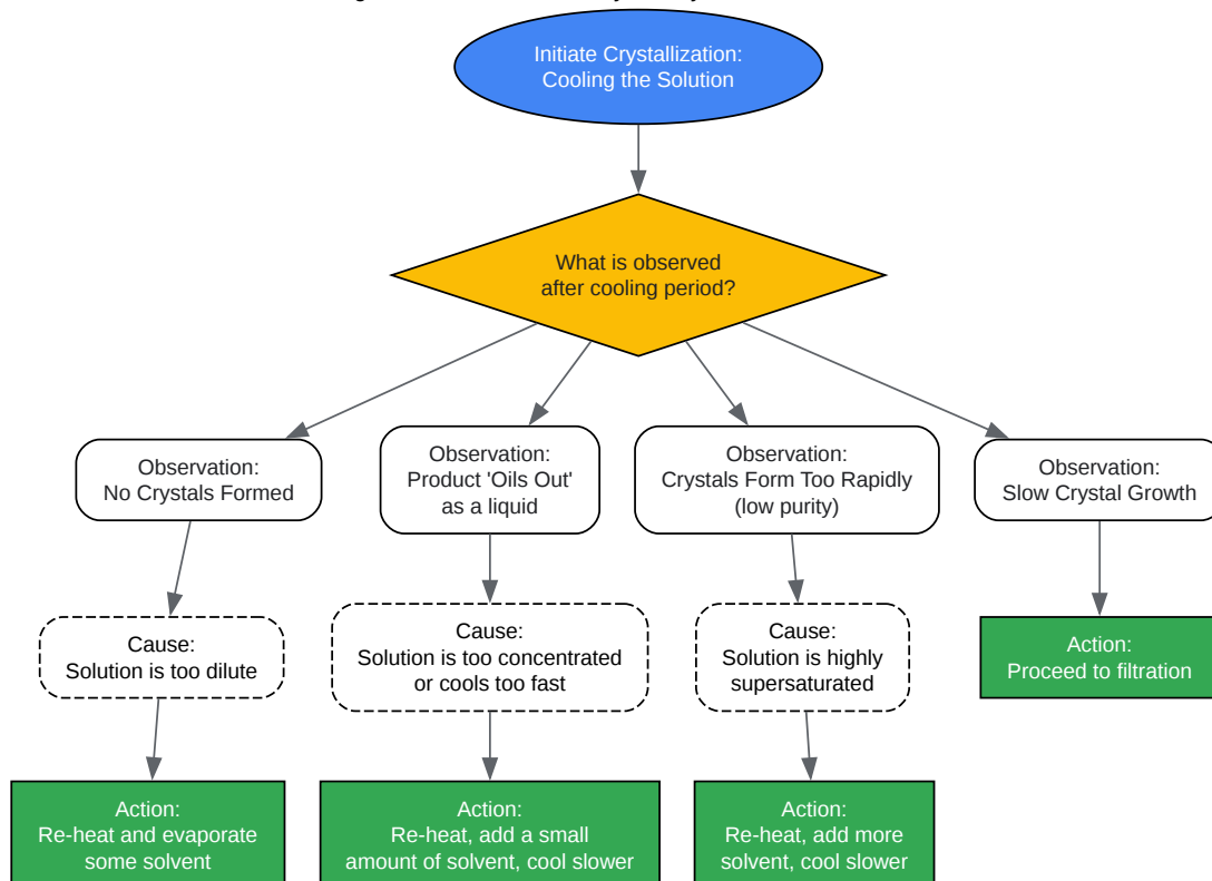
Diagram 3: Decision Pathway for Crystallization Problems

Click to download full resolution via product page