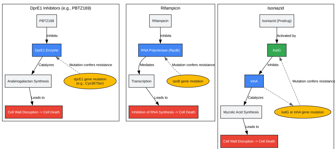
Mechanism of Action & Resistance of DprE1 Inhibitors vs. Other TB Drugs