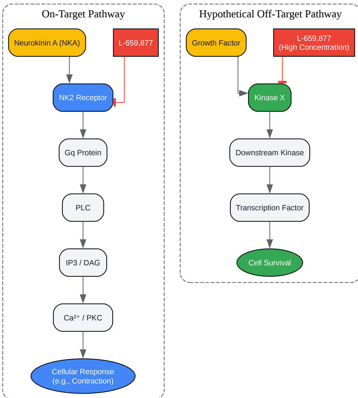
Diagram: Hypothetical Off-Target Interaction of L-659,877

Click to download full resolution via product page