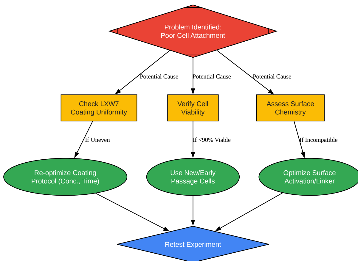
Caption: Experimental workflow for LXW7 graft coating and evaluation.

Click to download full resolution via product page