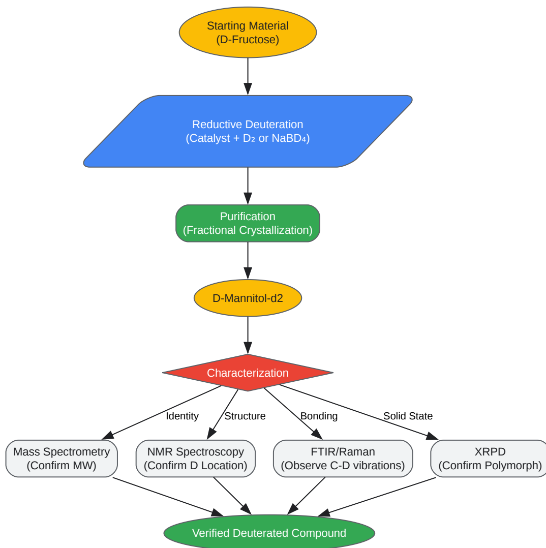
Fig. 3: Synthesis and Characterization Workflow

Click to download full resolution via product page