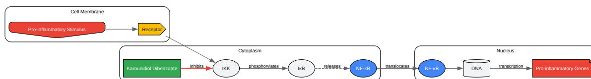
Diagram of a Potential Anti-inflammatory Signaling Pathway:

Click to download full resolution via product page