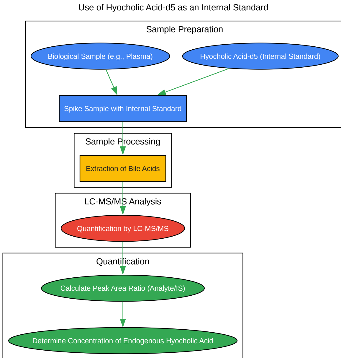
Caption: Workflow for Determining Isotopic Purity of Hyocholec Acid-d5 .

Click to download full resolution via product page