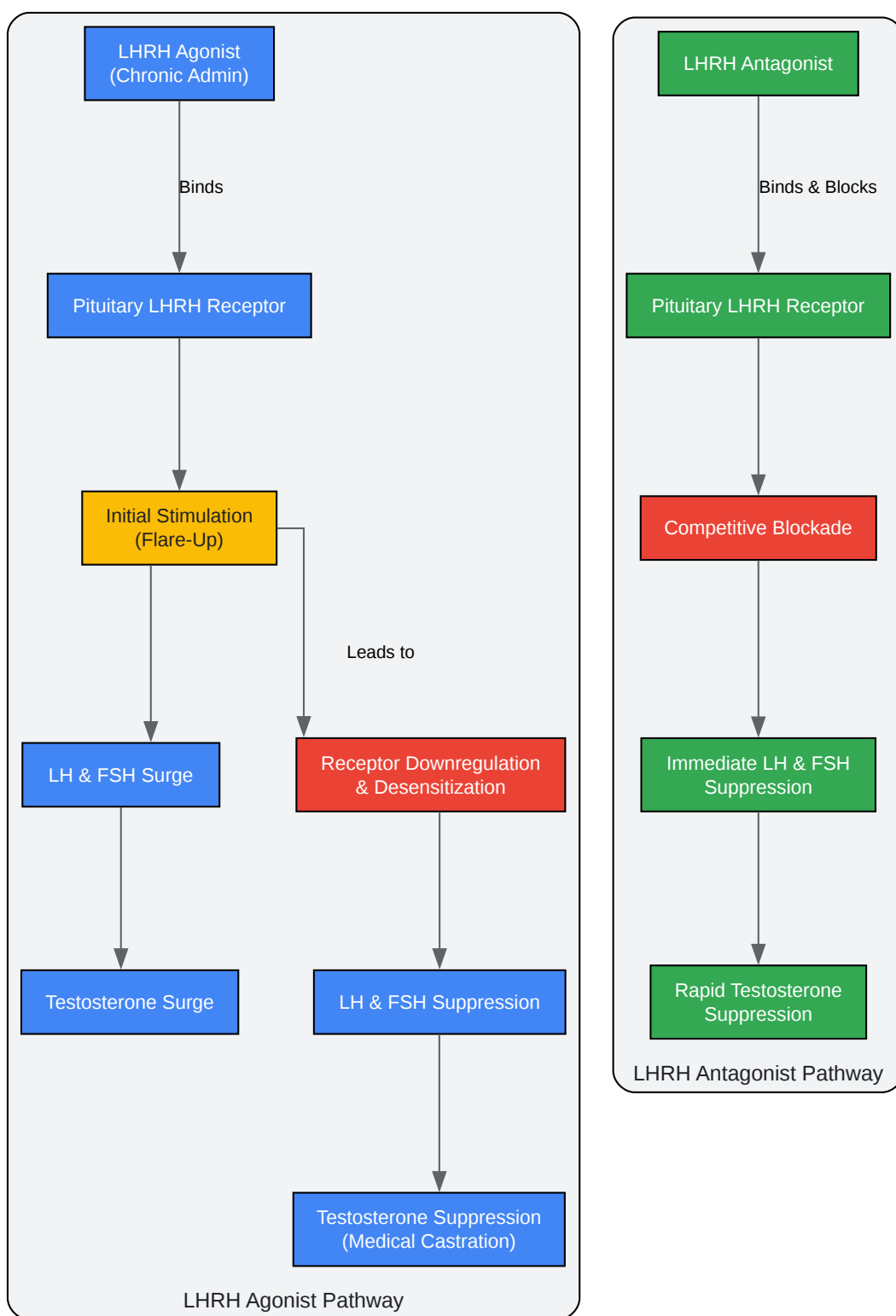
Figure 1. Comparative Mechanisms of LHRH Analogs

Click to download full resolution via product page