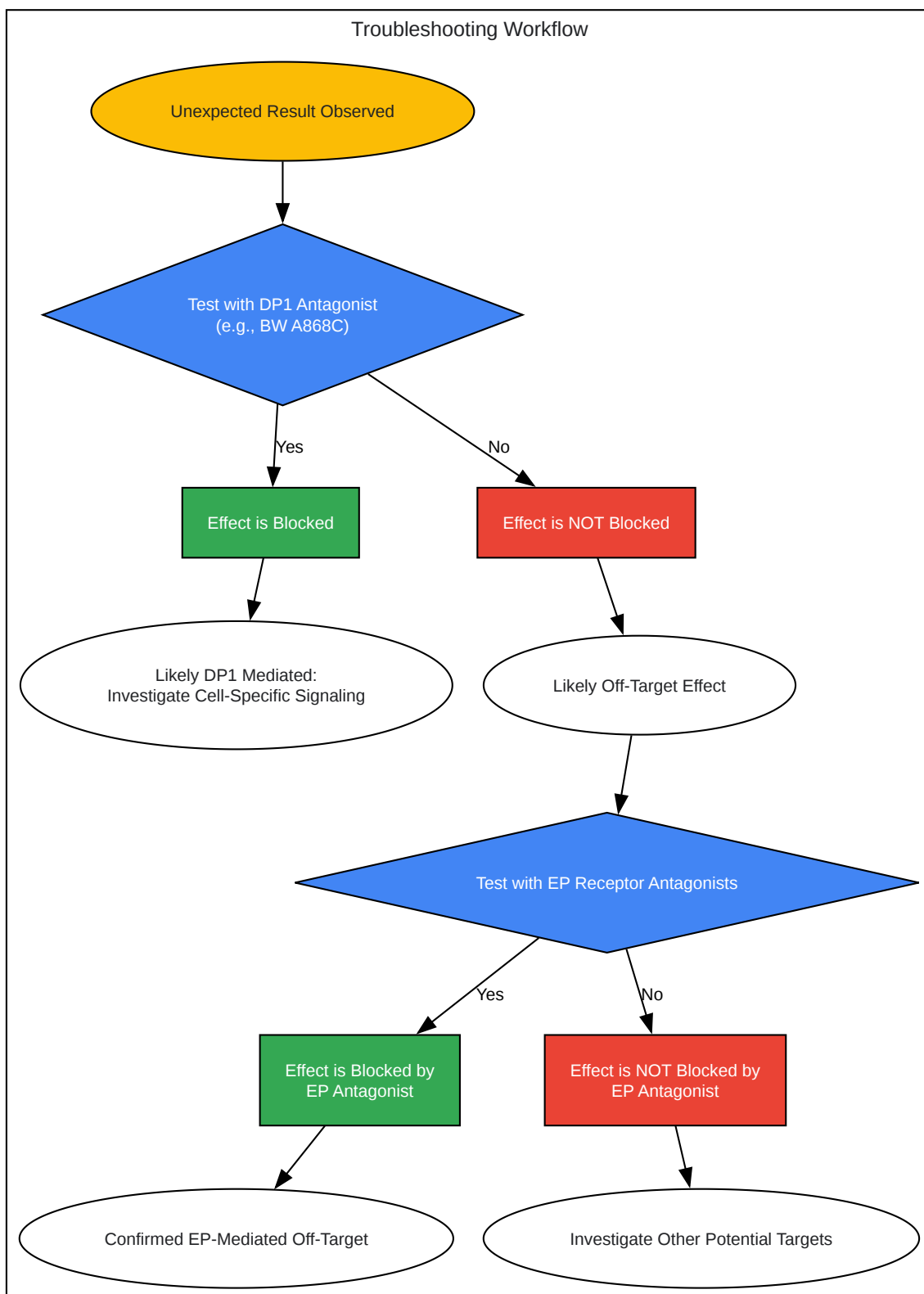
Caption: Signaling pathways of (8- epi )-BW 245C .

Click to download full resolution via product page