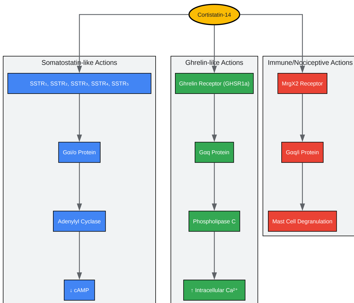
Figure 1: Overview of Major CST-14 Signaling Pathways

Click to download full resolution via product page