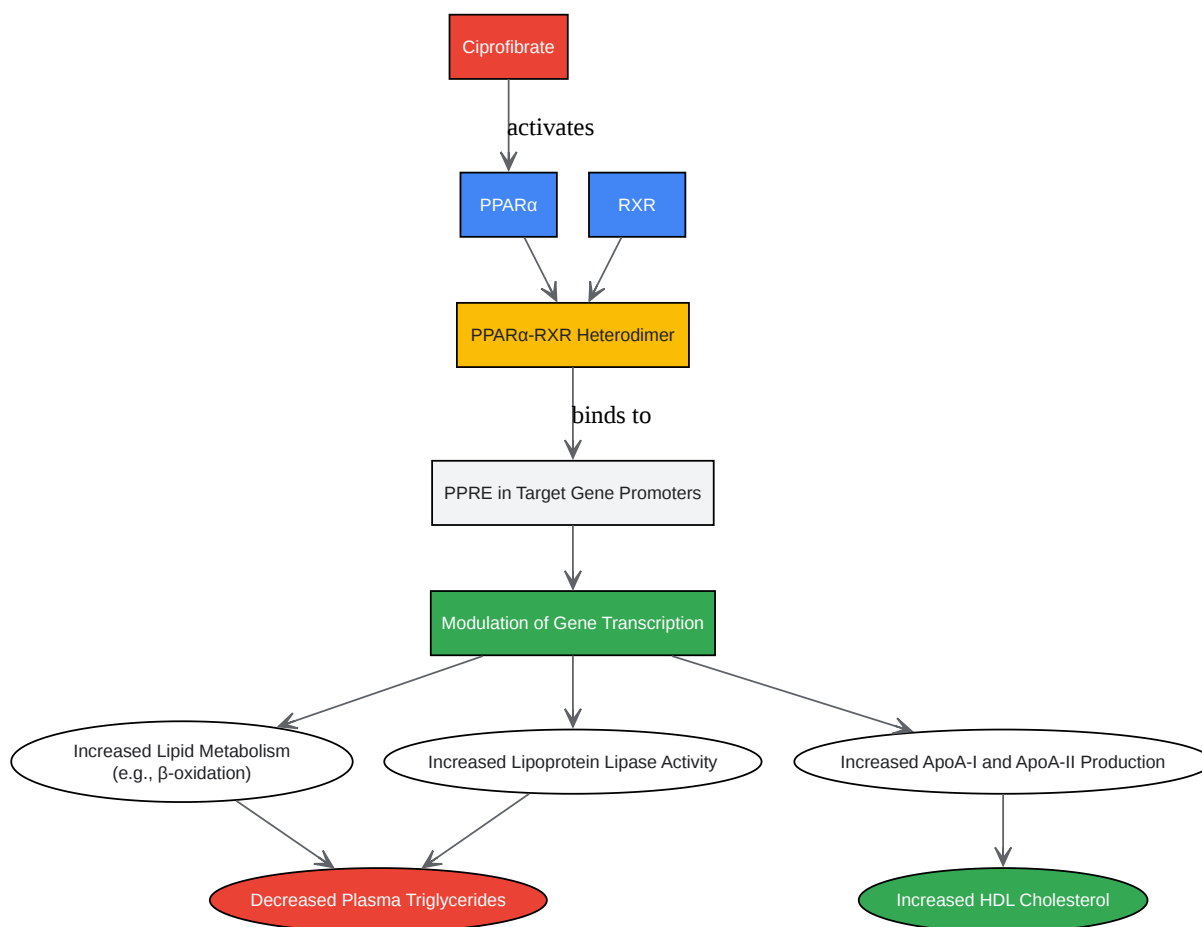
Figure 2: Ciprofibrate Signaling Pathway

Click to download full resolution via product page