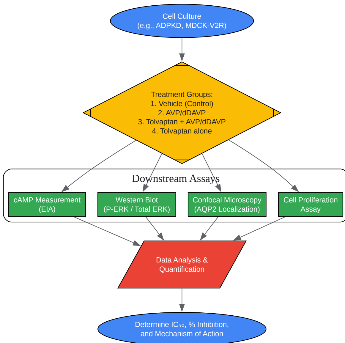
Generalized In Vitro Efficacy Testing Workflow

Click to download full resolution via product page