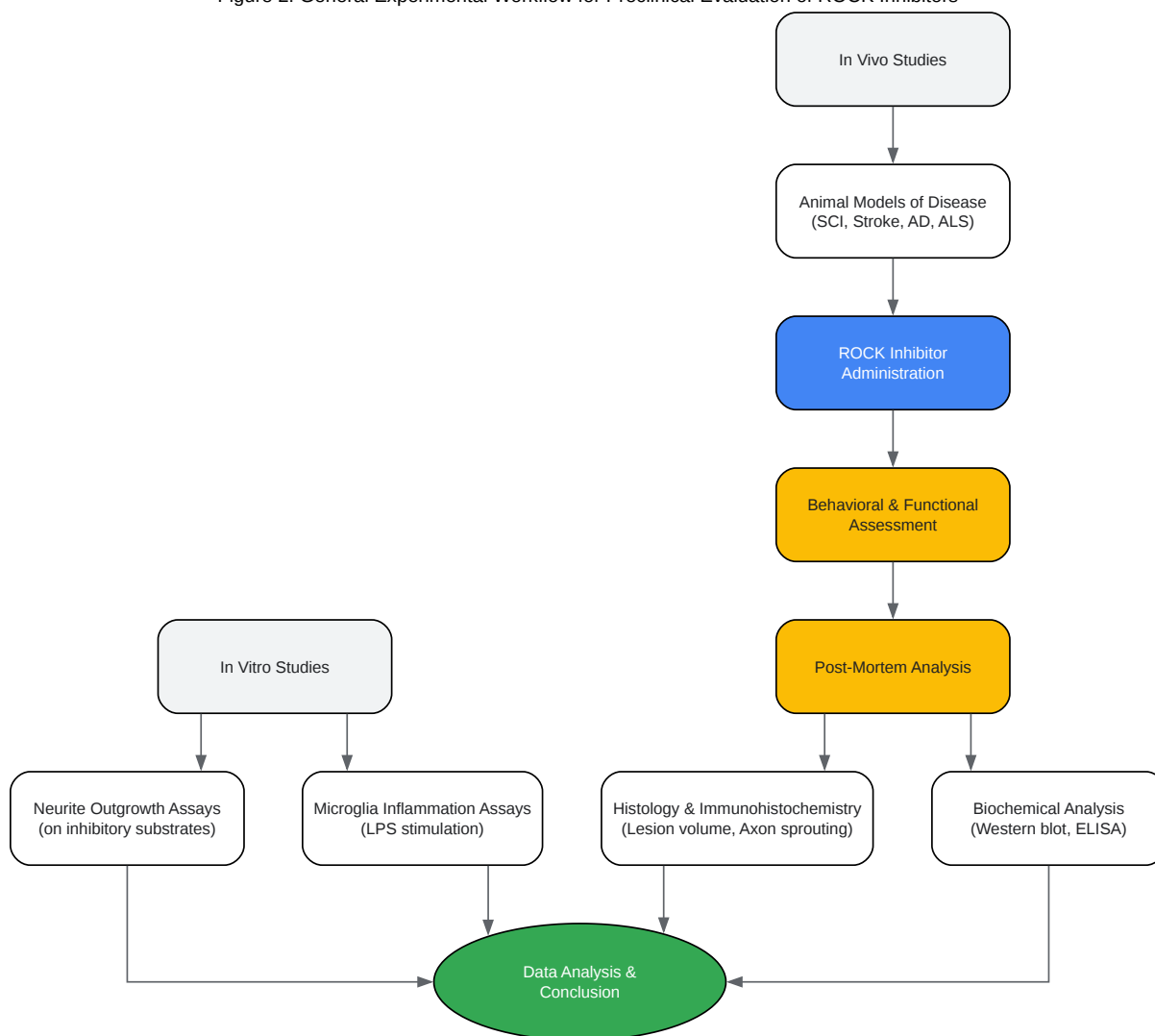
Figure 2: General Experimental Workflow for Preclinical Evaluation of ROCK Inhibitors

Click to download full resolution via product page