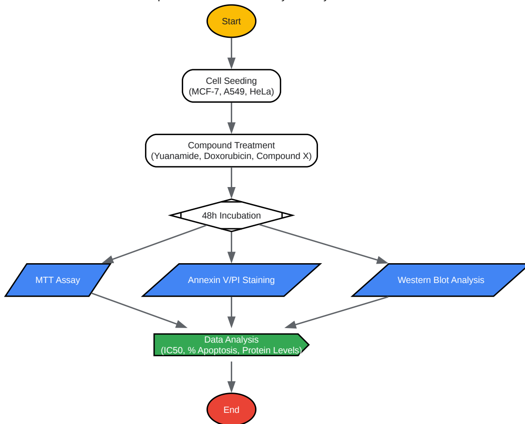
Experimental Workflow for Cytotoxicity Assessment

Click to download full resolution via product page