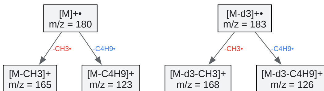
Proposed Fragmentation Pathway of 2-(tert-Butyl)-4-methoxyphenol

Click to download full resolution via product page