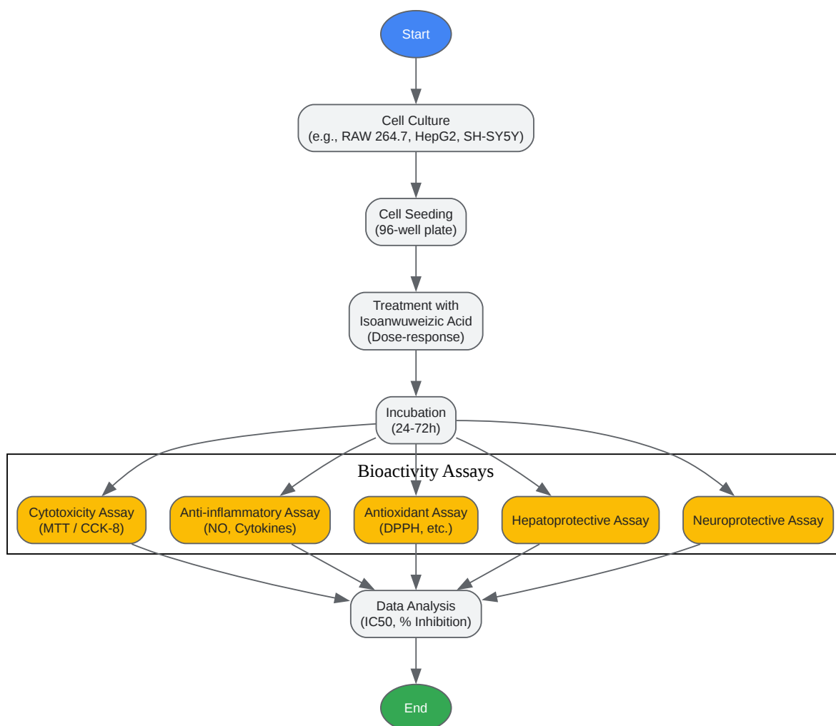
Diagram 2: General Workflow for In Vitro Cytotoxicity and Bioactivity Screening

Click to download full resolution via product page