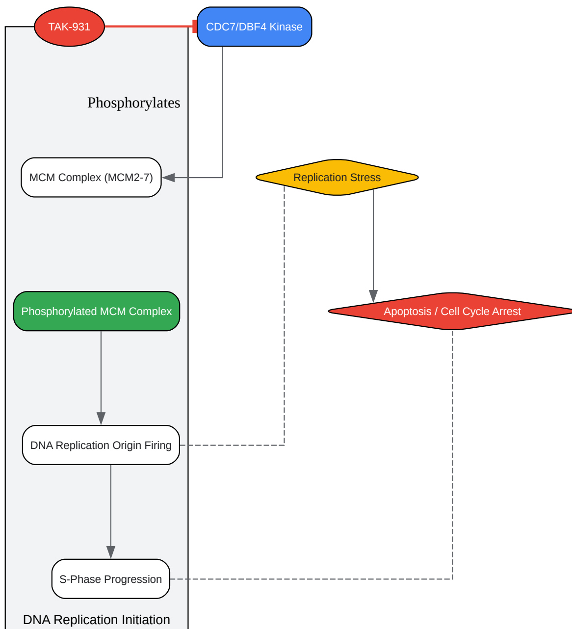
Figure 1: TAK-931 Mechanism of Action

Click to download full resolution via product page