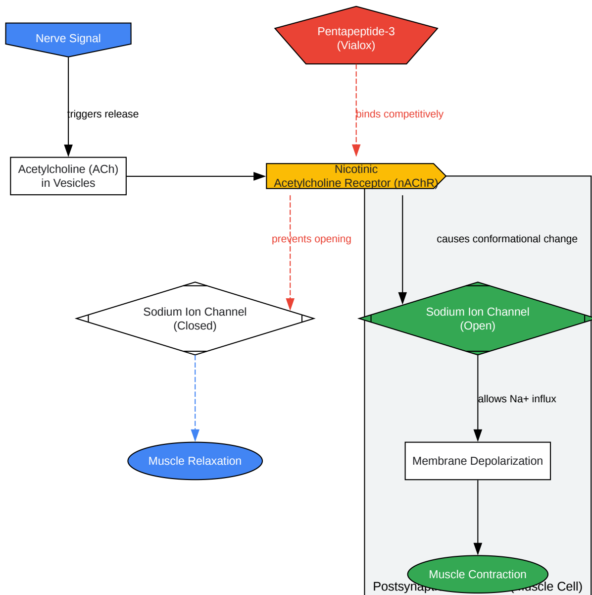
Figure 1: nAChR Signaling Pathway Inhibition by Pentapeptide-3

Click to download full resolution via product page