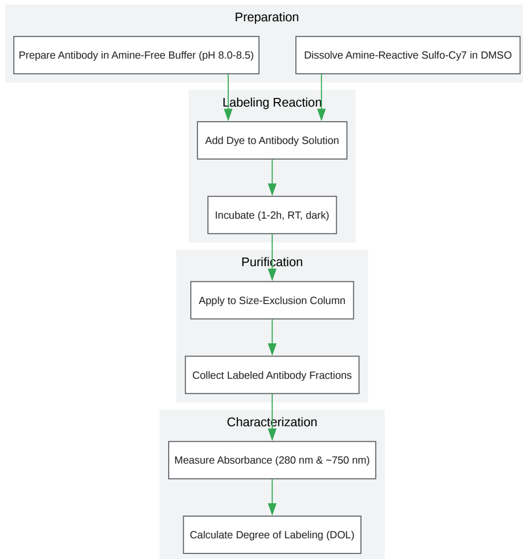
Workflow for Antibody Labeling and Purification

Click to download full resolution via product page