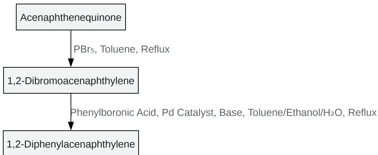
Figure 1. Proposed Synthetic Pathway for 1,2-Diphenylacenaphthylene

Click to download full resolution via product page