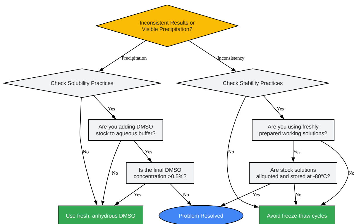
Caption: Recommended experimental workflow for handling TP0586532 .

Click to download full resolution via product page