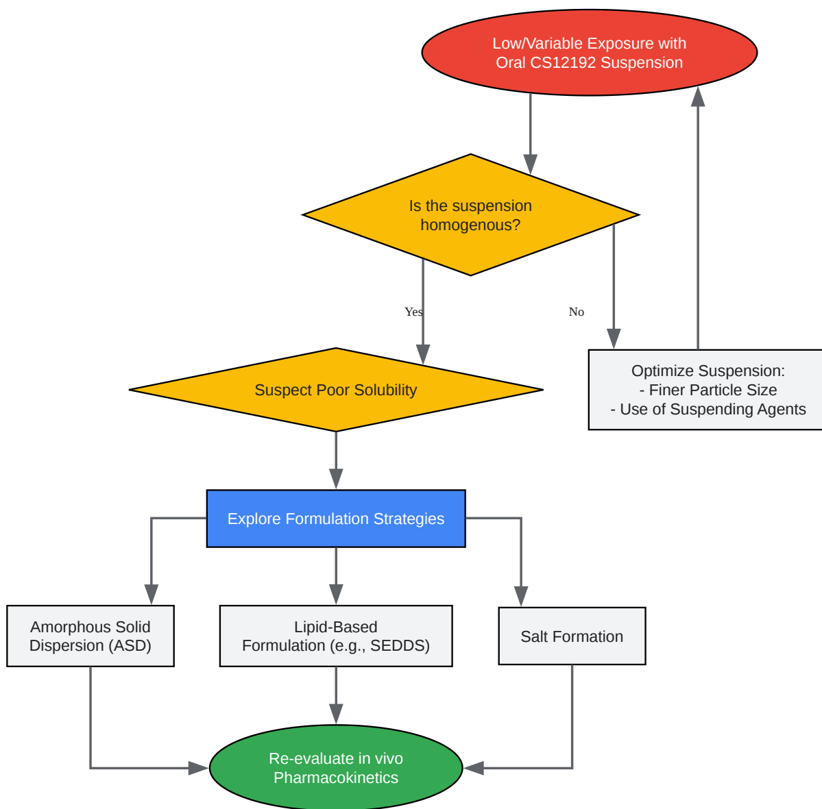
Diagram 5.2: Troubleshooting Workflow for Poor Oral Bioavailability of CS12192

Click to download full resolution via product page