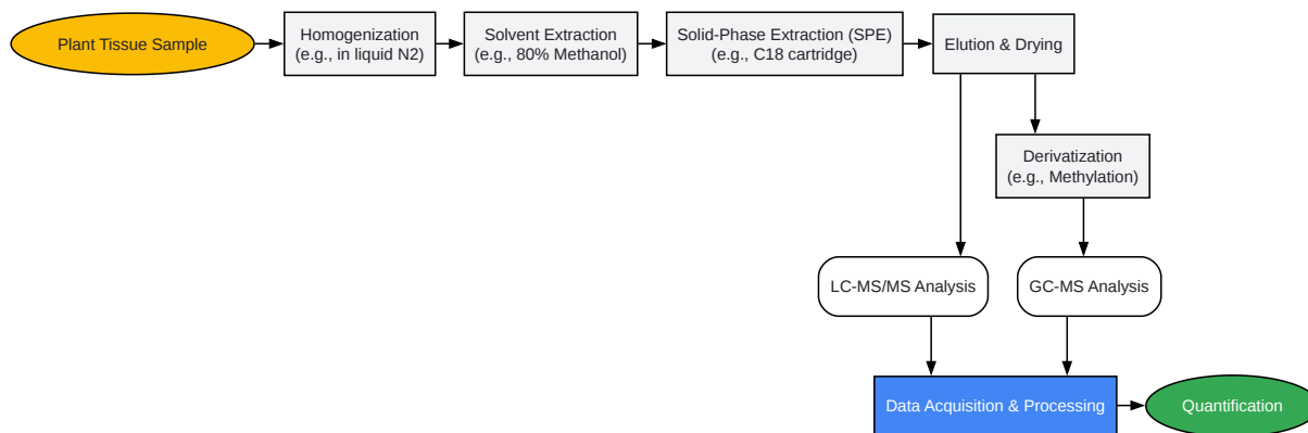
Caption: Simplified Jasmonic Acid Signaling Pathway.

Click to download full resolution via product page