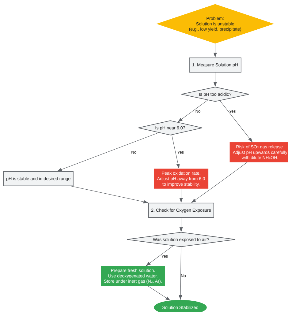
Troubleshooting Workflow for Unstable Ammonium Sulfite Solutions

Click to download full resolution via product page