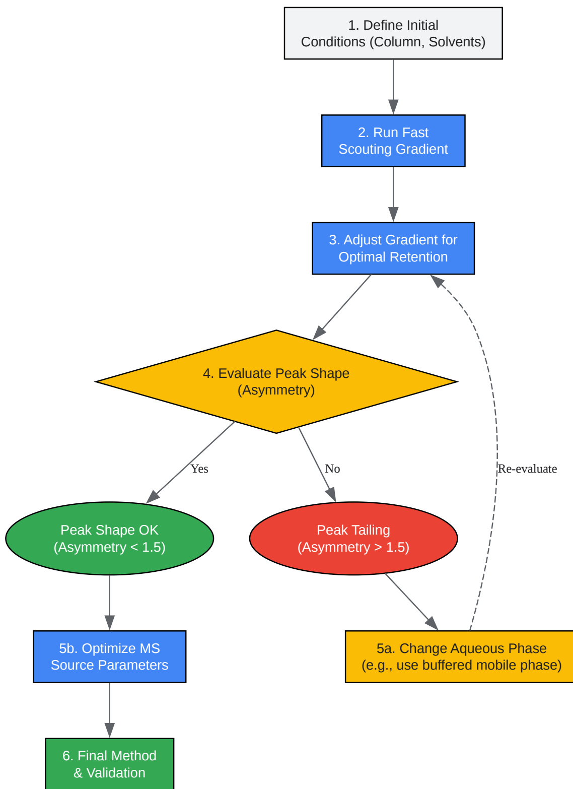
Workflow for Mobile Phase Optimization

Click to download full resolution via product page