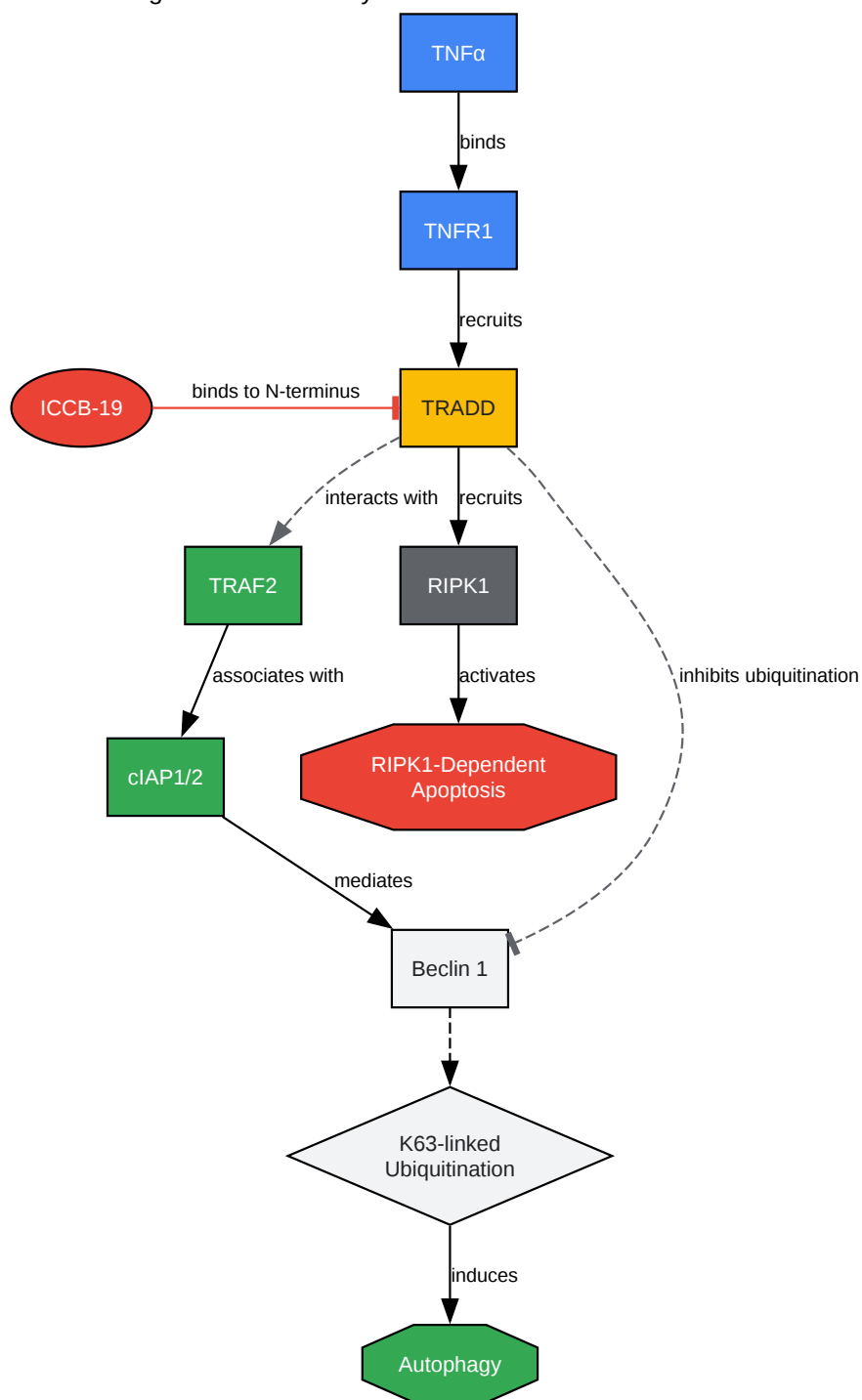
Figure 1: ICCB-19 Hydrochloride Mechanism of Action

Click to download full resolution via product page