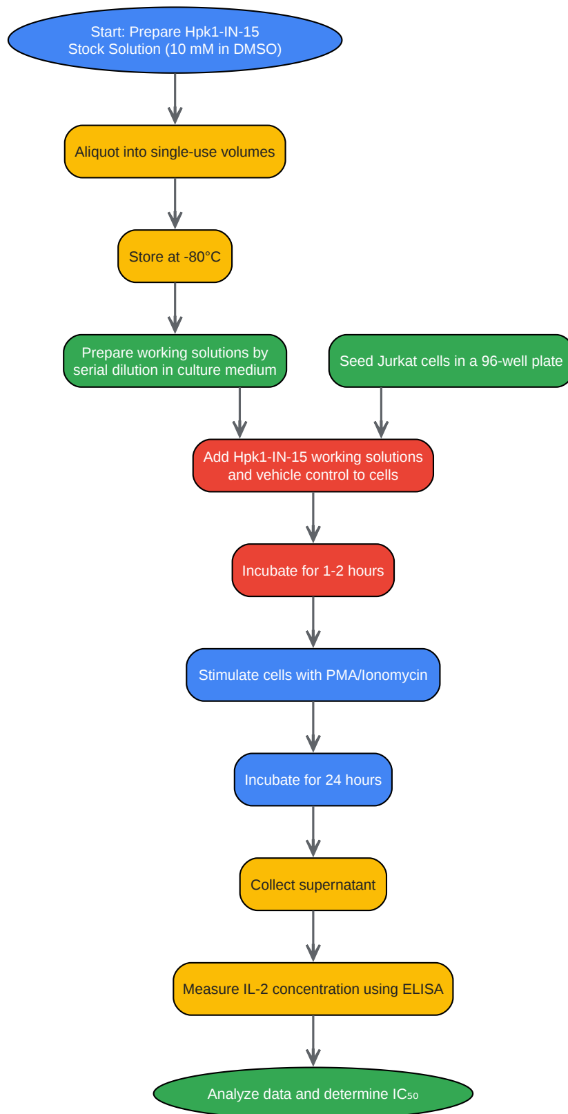
Caption: HPK1 Signaling Pathway in T-Cell Activation.

Click to download full resolution via product page