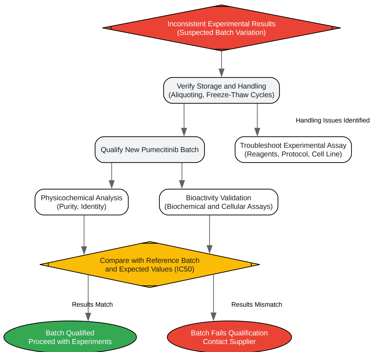
Diagram: Troubleshooting Workflow for Pumecitinib Batch Variation

Click to download full resolution via product page