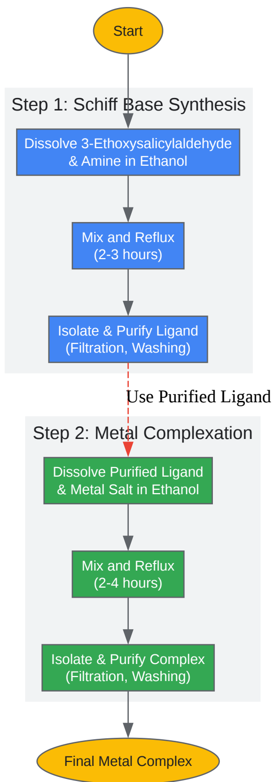
General Synthesis Workflow

Click to download full resolution via product page