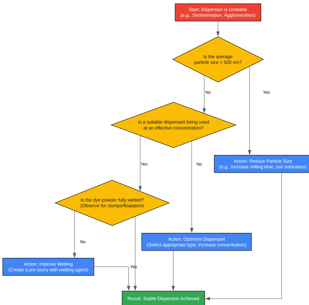
Troubleshooting Workflow for Disperse Yellow 54 Dispersion Issues