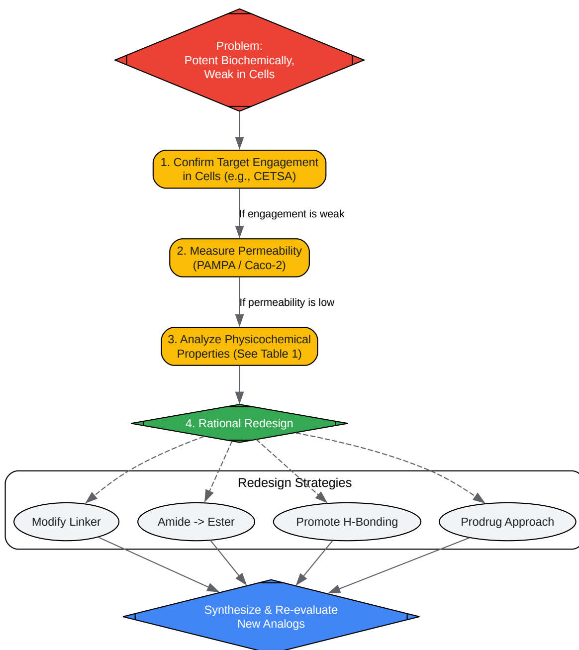
Figure 2: A troubleshooting workflow for addressing poor PROTAC permeability.