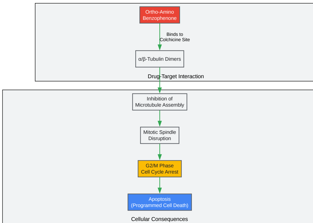
Figure 1: Anticancer Mechanism of Ortho-Aminobenzophenones