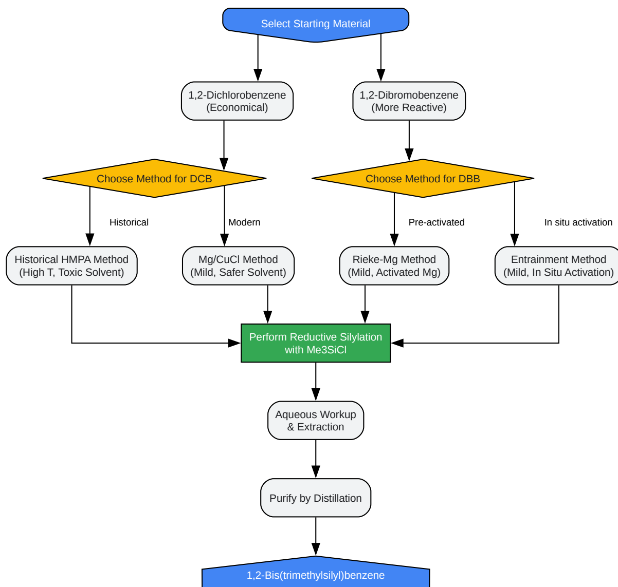
Caption: Reductive silylation pathways to 1,2-bis(trimethylsilyl)benzene .

Click to download full resolution via product page