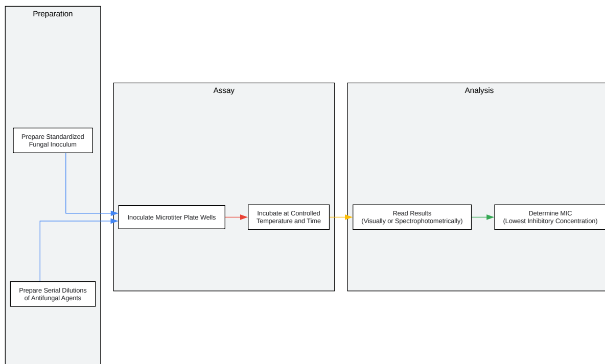
Broth Microdilution MIC Determination Workflow

Click to download full resolution via product page