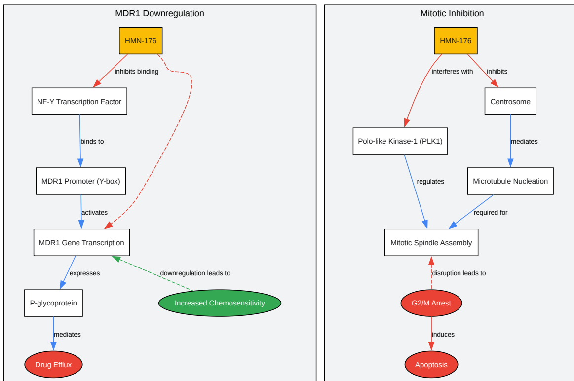
HMN-176 Mechanism of Action