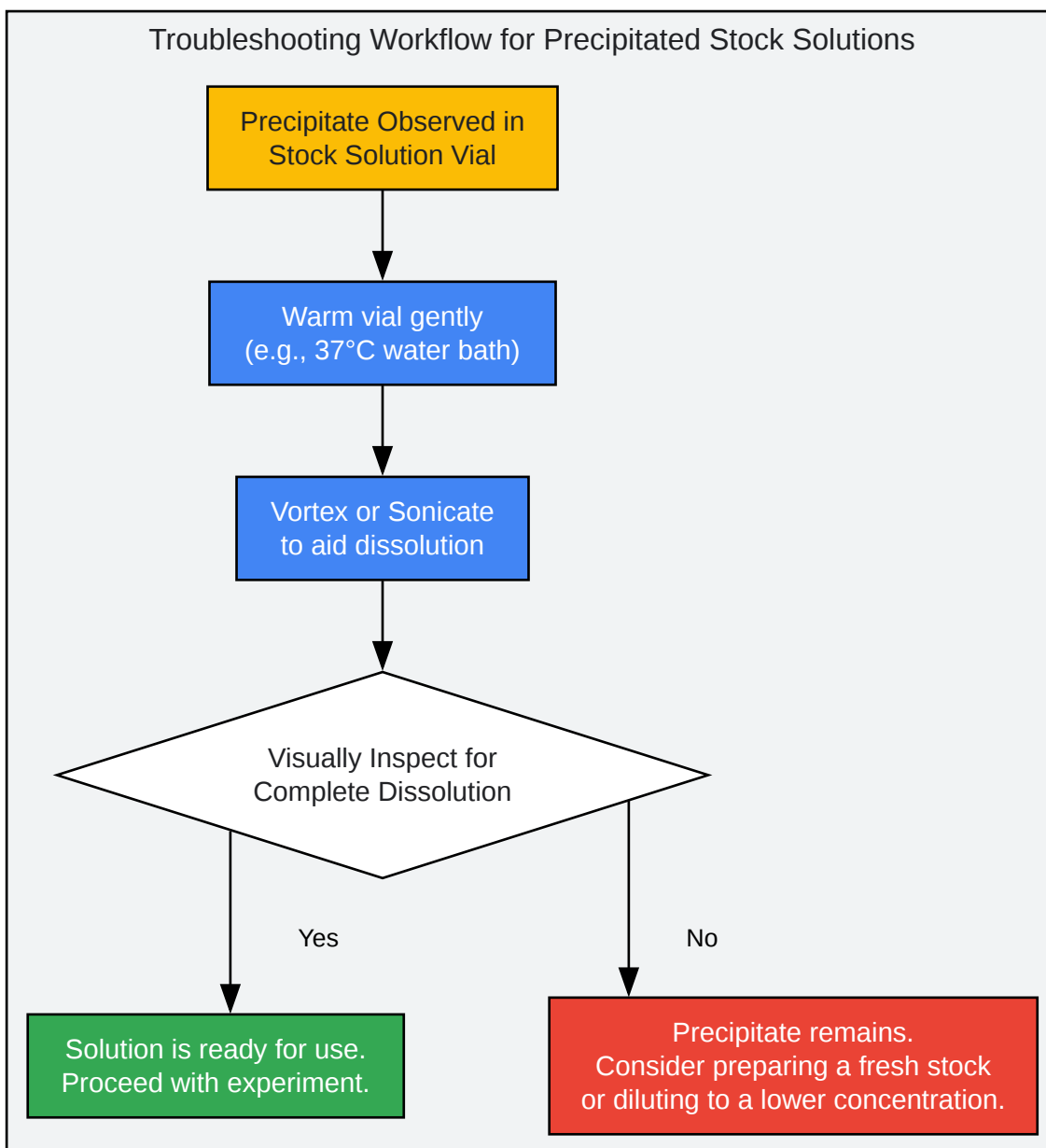
Diagram: Workflow for Resolving Precipitation

Click to download full resolution via product page