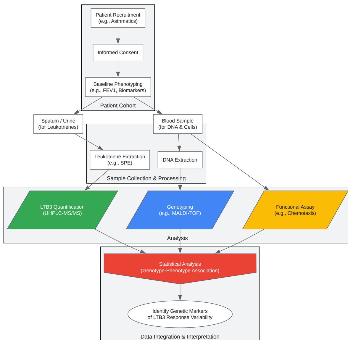
Figure 3: Workflow for a Leukotriene Pharmacogenetic Study

Click to download full resolution via product page